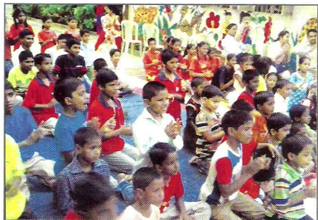
Children of Vatsalaya foundation enjoying the magic show

It was a unique experience for the members of MUNA and was extremely gratifying to see the joy and happiness on children's smiling faces.